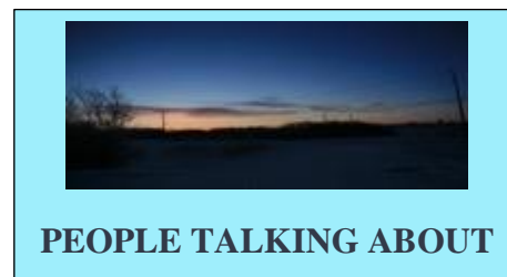
PEOPLE TALKING ABOUT

People have also stressed the far-reaching effects that international, national, and regional management policies can have on even the smallest community.