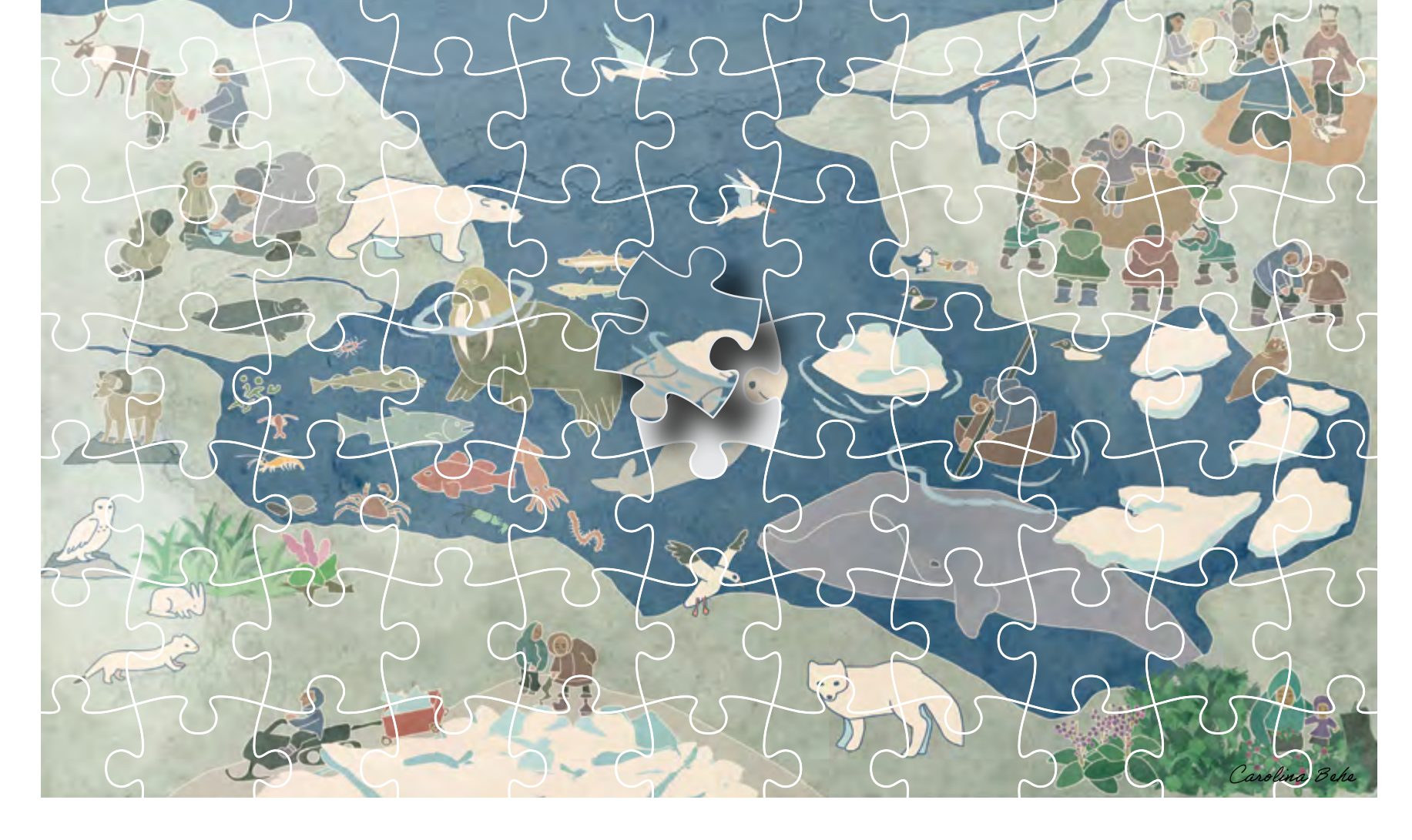
Image reference – Inuit Circumpolar Council-Alaska. 2015. Alaskan Inuit Food Security Conceptual Framework: How to Assess the Arctic From an Inuit Perspective. Technical Report. Anchorage, Alaska.

Text reference – Inuit Circumpolar Council-Alaska. 2015. Alaskan Inuit Food Security Conceptual Framework: How to Assess the Arctic From an Inuit Perspective. Technical Report. Anchorage, AK; Inuit Circumpolar Council Alaska. 2020. Food Sovereignty and Self-Governance: Inuit Role in Managing Arctic Marine Resources. Anchorage, Alaska.