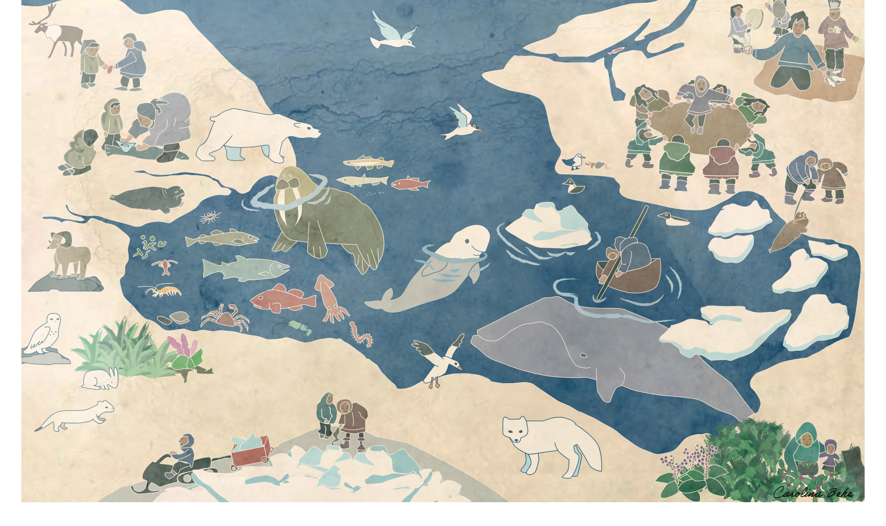
Image reference – Inuit Circumpolar Council-Alaska. 2015. Alaskan Inuit Food Security Conceptual Framework: How to Assess the Arctic From an Inuit Perspective. Technical Report. Anchorage, AK.

Text reference – Inuit Circumpolar Council-Alaska. 2015. Alaskan Inuit Food Security Conceptual Framework: How to Assess the Arctic From an Inuit Perspective. Technical Report. Anchorage, AK; Inuit Circumpolar Council Alaska. 2020. Food Sovereignty and Self-Governance: Inuit Role in Managing Arctic Marine Resources. Anchorage, AK