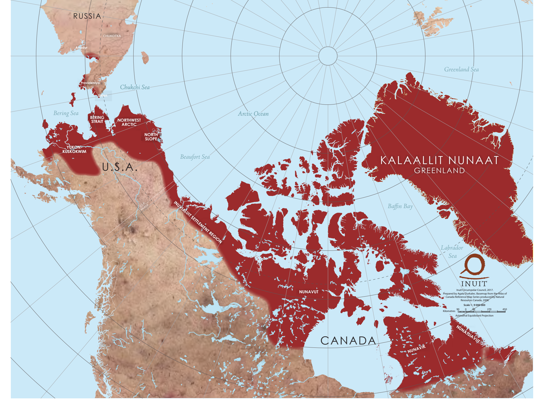
Figure 1: Inuit Homelands

Image reference: Inuit Circumpolar Council Alaska. 2020. Food Sovereignty and Self-Governance: Inuit Role in Managing Arctic Marine Resources. Anchorage, Alaska.